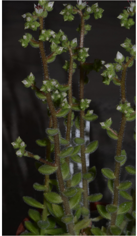
Sedum hintonii inflorescence