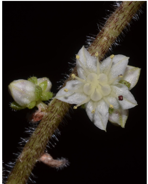
Sedum hintonii floral stem