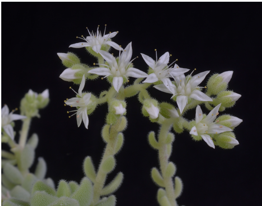
Figure 7. Sedum piaxtlaense. Flowering plant in cultivation.

mos, municipality Huejuquilla el Alto, Jalisco and two populations in Zacatecas, one along the Río Atengo near San Juan Capistrano and the other near Pico del Aguila, are in need of study.