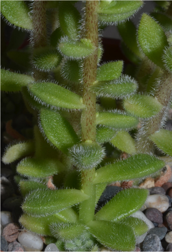
Sedum hintonii basal leaves of the floral stem