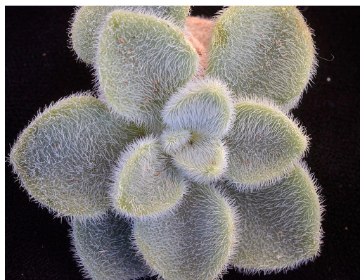
Figure 4. Detail of densely pilose leaves of Sedum piactlaense.