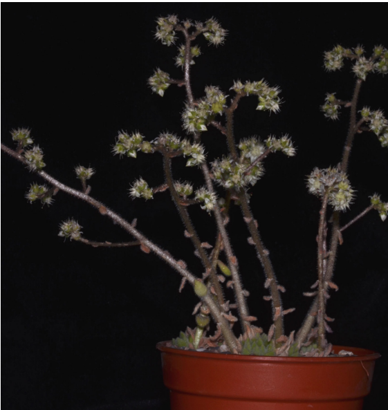
Sedum hintonii in a green house